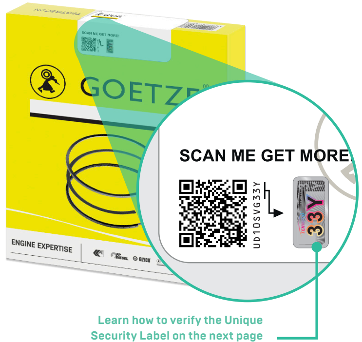
Learn how to verify the Unique Security Label on the next page

Scan the code and it gives you the instant peace-of-mind that the product is a genuine Goetze® part .